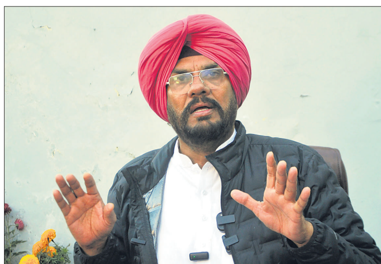
VIOLATION OF HUMAN RIGHTS