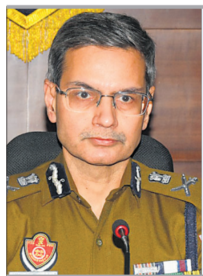
'WILL TAKE ACTION AGAINST CULPRITS'

The DGP said the team has been empowered to co-opt any other police officer in the inquiry and will maintain coordination with the senior superintendents of police and com-